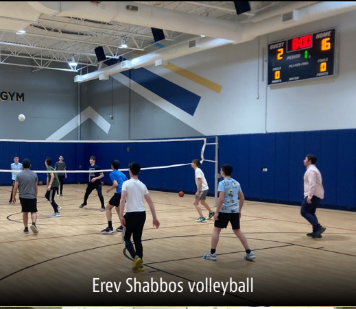
Erev Shabbos volleyball