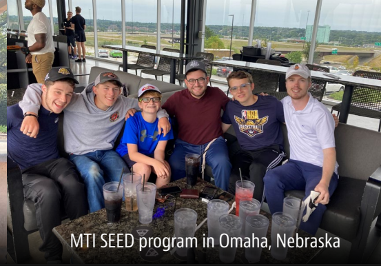
MTI SEED program in Omaha, Nebraska