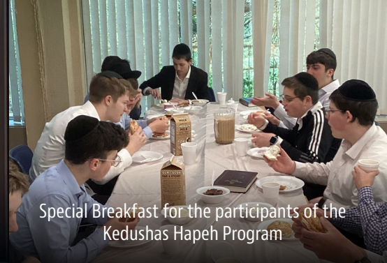
Special Breakfast for the participants of the Kedushas Hapeh Program