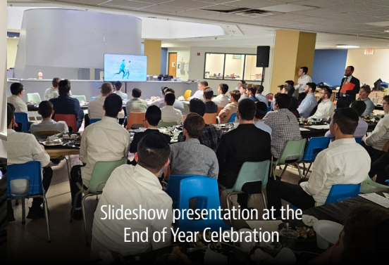
Slideshow presentation at the End of Year Celebration