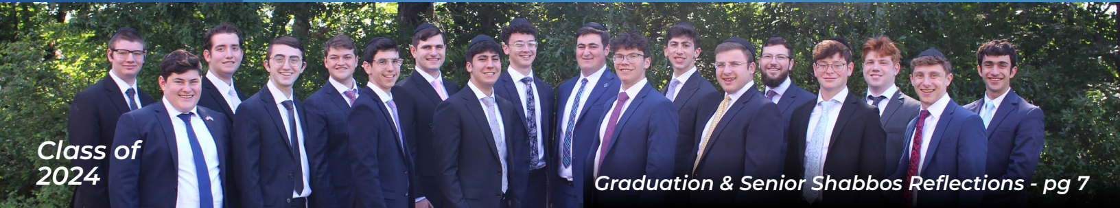
Class of 2024