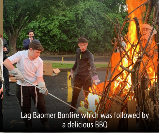
Lag Baomer Bonfire which was followed by a delicious BBQ