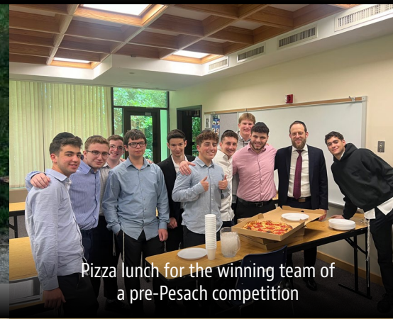
Pizza lunch for the winning team of a pre-Pesach competition