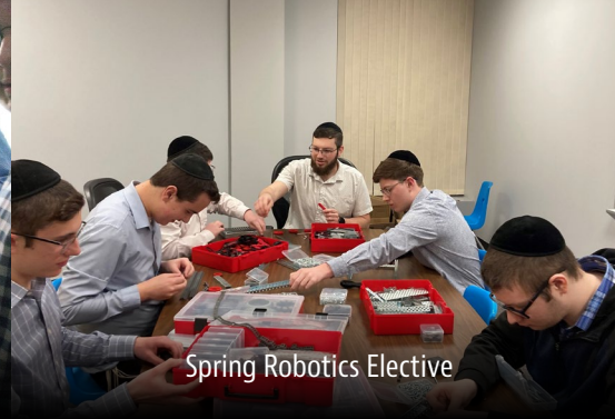
Spring Robotics Elective