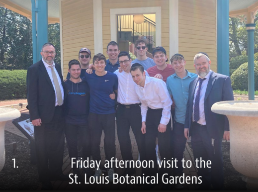
1. Friday afternoon visit to the St. Louis Botanical Gardens