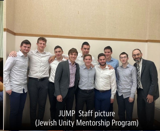
JUMP Staff picture (Jewish Unity Mentorship Program)