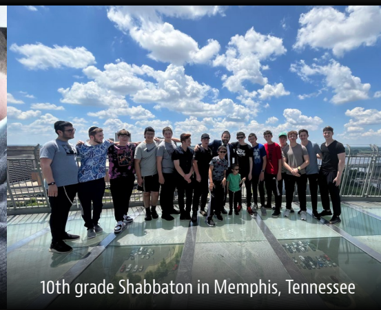
10th grade Shabbaton in Memphis, Tennessee