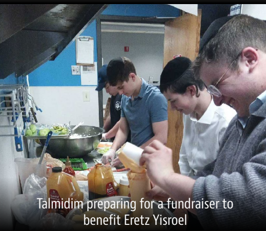
Talmidim preparing for a fundraiser to benefit Eretz Yisroel