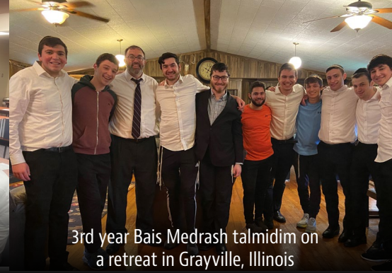
3rd year Bais Medrash talmidim on a retreat in Grayville, Illinois