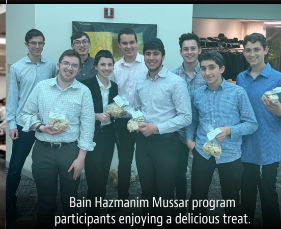
Bain Hazmanim Mussar program participants enjoying a delicious treat.