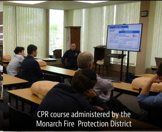
CPR course administered by the Monarch Fire Protection District