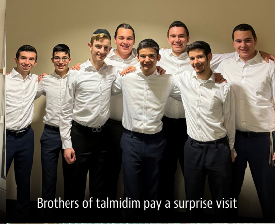
Brothers of talmidim pay a surprise visit